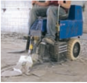
Efficiently works on all applications