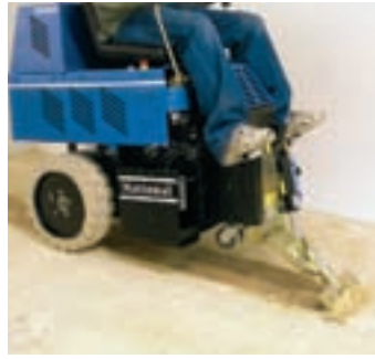
Front sliding plate allows for exact blade angle