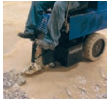
Excellent production rates

See in Action on the Web! www.nationalequipment.com