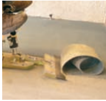
Easily removes the toughest of direct glued carpet