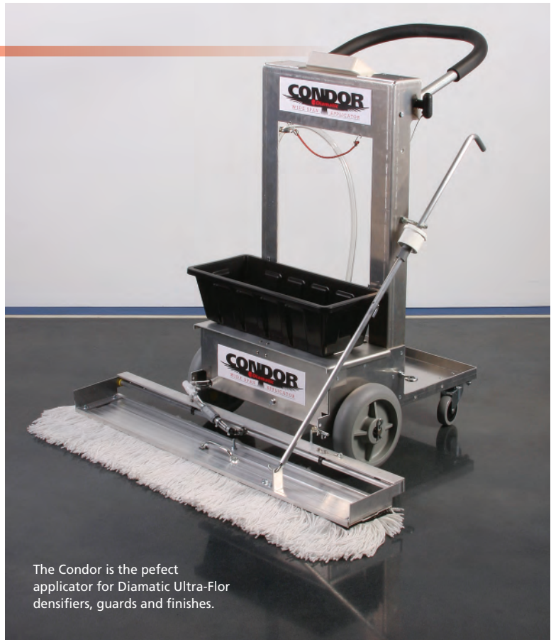
The Condor is the perfect applicator for Diamatic Ultra-Flor densifiers, guards and finishes.

The professional surface-prep contractor will appreciate the advantages of the Condor and why Diamatic is the best reflection of quality.