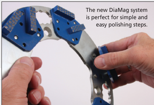
The new DiaMag system is perfect for simple and easy polishing steps.

Grinding Width: 20 in. (508mm) Tool Diameter: 7 in. (179mm) Tooling Speed: 1050 RPM Motor Speed: 1750 RPM Motor: 12 hp max. Amperage: 15/26 A Voltage: 230/480V, 3ø, 60 Hz Power Cord: 50 ft. Dust Hose Connection: 3 in. (76mm)Ø Dimensions: L77 in. (1956mm) x W 21 in. (533mm) x H 45 in. (1143mm) Weight: 595 lbs (270kg)